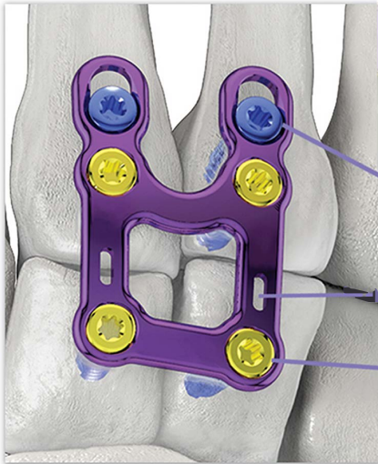
2nd and 3rd Dual Ray Plate

All plates contain compression slot which sits distally allowing for better screw purchase in diaphyseal bone